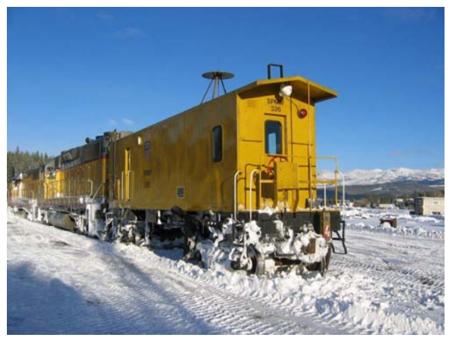
An SP Flanger Still at Work in the Sierra